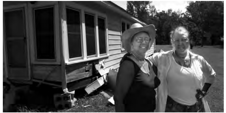
A small house can be seen in the distance behind the group of community improvement leaders at the stop sign. The picture on the upper right shows a close up of that house and occupants and damage done by an automobile that left the road.