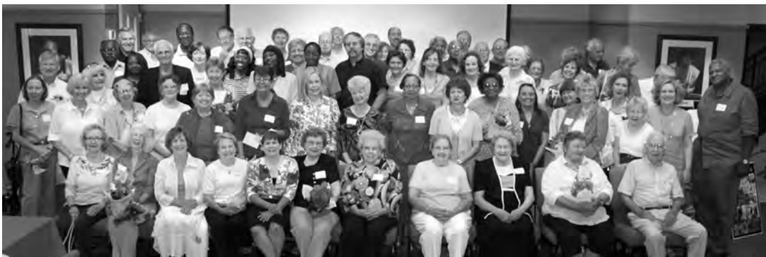
Eastern Shore volunteers at Fairhope United Methodist Church

In the last fiscal year, the work provided by volunteers reached a monetary value of approximately $90,000.