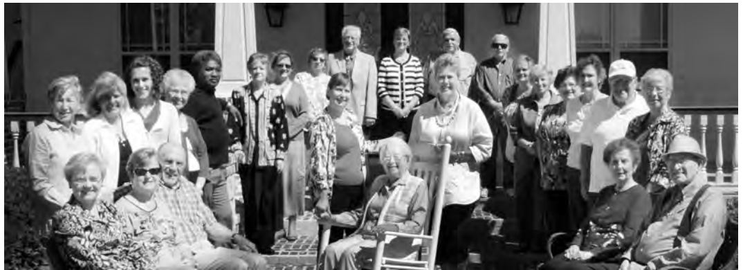
South Baldwin volunteers at Cottages on the Green

It is difficult to express the gratefulness we feel for all the dedicated servants to this ministry. In an effort to show our appreciation, EMI honored its volunteers on the Eastern Shore and South Baldwin County with an April lunch in Fairhope and a brunch in Foley. EMI staff served the meals. The theme, "Spreading Seeds of